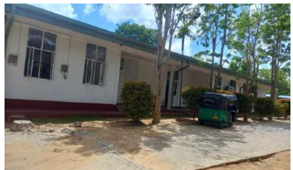
Construction of Samanthurai Prefabricated Court Building