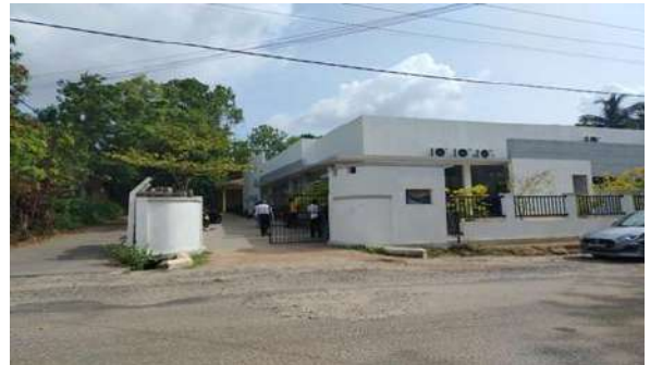
Construction of Nikaweratiya Prefabricated Court Building