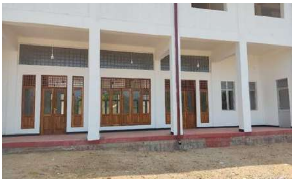
Construction of Vakareai New Court Building