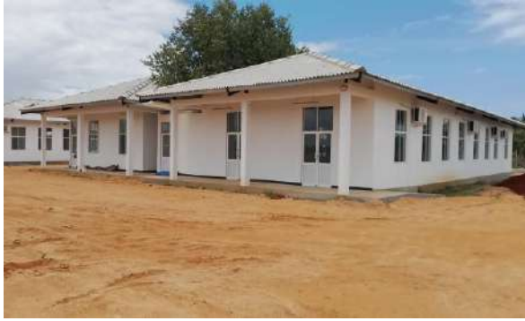
Construction of Valachchenei Prefabricated Court Building