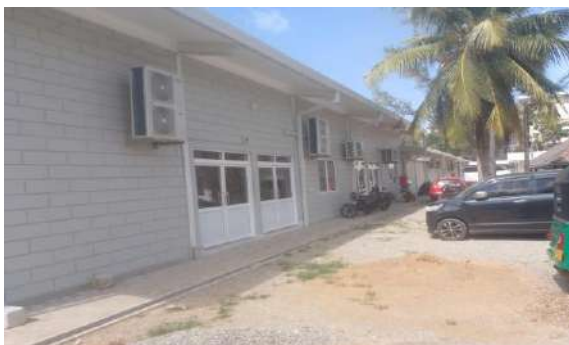
Construction of Puttalam Prefabricated Court Building